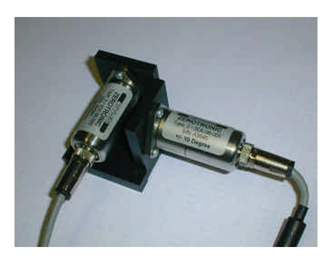
Figure 1: Initial prototype

The inclinometer unit was designed in three successive stages in order to progressively prove the feasibility of various aspects of the concept. The first cube prototype, shown in <u>Figure 1</u>, involved mounting both sensors to a modified right angle plate. The robot mounting plates were retained and the measurement process automated via software. Although it was constructed essentially to prove the automation concept, the system also yielded a slightly improved recalibration error by eliminating the error due to manual jogging of the robot and eliminating one of the right-angle plates.