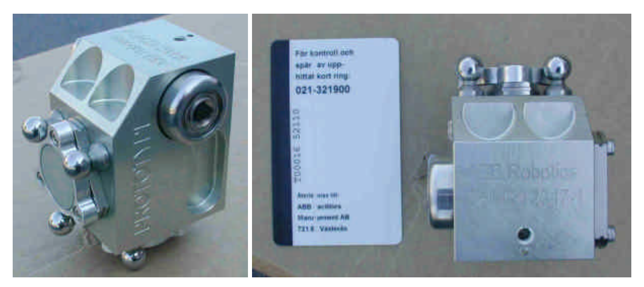
Figure 4: (a) Product prototype and (b) size relative to credit card

The product prototype is integrated with existing large robots through an add-on kit wherein the V-groove plates are permanently bolted to the robot structure. For optimal cost and performance V-grooves are directly machined into the robot structure on newer robot models. The results of recalibration tests satisfy the original specifications, revealing an error of 0.2mm, which represents a five-fold improvement on the existing system.